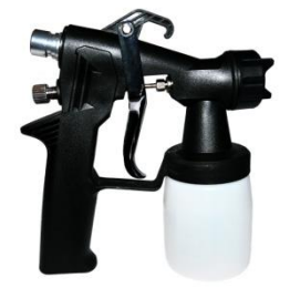
1 x Spray Gun