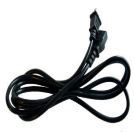
1 x Power Cord